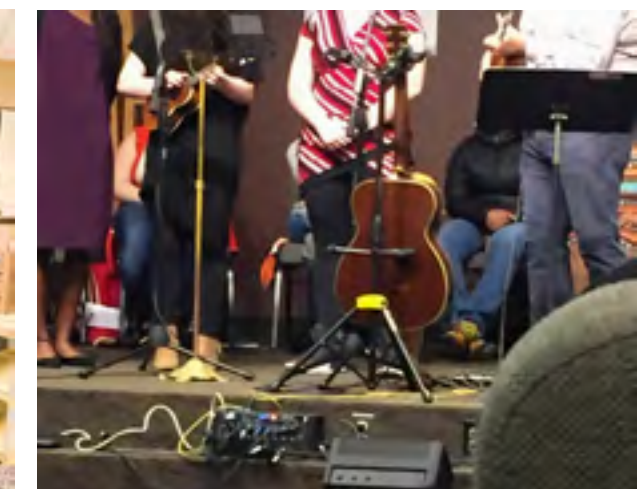
Because of the space the Nagel Chapel provides, fun events, such as Life-Sized Candy Land, Start of Summer Sno-Cone celebrations, and Music Therapy Performances and Talent Shows, are possible!

Want to know more about how our Chaplaincy services are transforming lives? Check out this episode of WEDGWOOD'S COFFEE BREAK CONVERSATIONS!