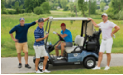
35th Annual Charity Golf Classic