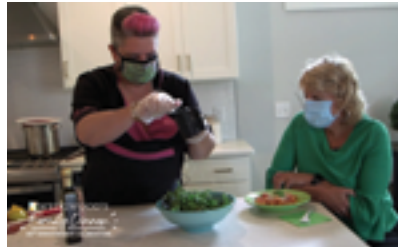
Wedgwood's Family Dinner: 60th Anniversary Celebration