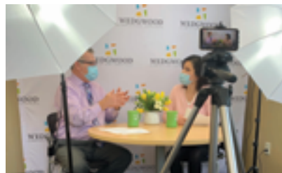
Women of Wedgwood: Facebook Live Conversation