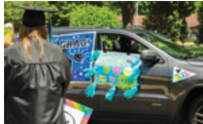
Lighthouse Academy Graduation for Wedgwood Resident