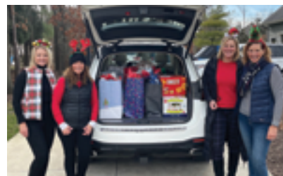
Christmas at Wedgwood