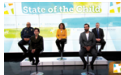
State of the Child Panel Conversation