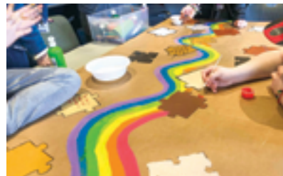
Martin Luther King Jr. Day Celebration