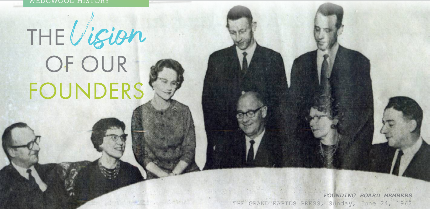
FOUNDING BOARD MEMBERS THE GRAND RAPIDS PRESS, Sunday, June 24, 1962

The founders of Wedgwood Christian Services were guided by a clear vision: they desired to share God’s love with children and families in a manner that was both distinctively Christian and professionally excellent.